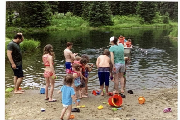
Fun at the pond