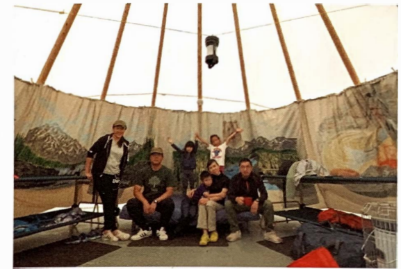
A peek inside a tipi

All the comforts of home...we provide private outdoor showers with a change room, clean waterless toilets, hand and dish washing stations. Gather around our covered picnic table area and have a BBQ! The kitchen is equipped with shelves, stove/oven, cupboards and a small fridge, table and chairs, drinking water dispenser. Various games for inside or out are available. Unique playground for the little ones. We even have a small store and gallery with unique arts and crafts!